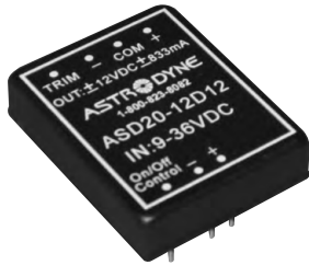
Unit measures 1.6"W x 2"L x 0.45"H