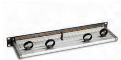
A rear cable manager is included with all AlphaSnap Patch Panels.