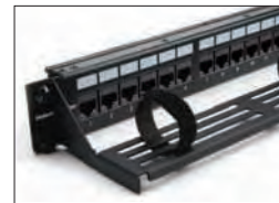
Optional Front Cable Manager