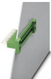
Feed-through header, number of positions: 16, pitch: 5 mm, color: green

Please be informed that the data shown in this PDF Document is generated from our Online Catalog. Please find the complete data in the user's documentation. Our General Terms of Use for Downloads are valid ( http://phoenixcontact.com/download )