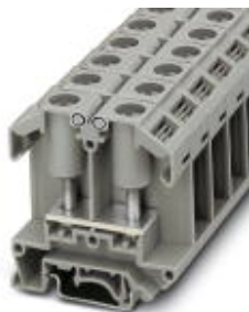
Universal terminal block with bolt connection, cross section: 0.1 - 25 mm 2 , width: 18 mm, color: gray

Please be informed that the data shown in this PDF Document is generated from our Online Catalog. Please find the complete data in the user's documentation. Our General Terms of Use for Downloads are valid ( http://download.phoenixcontact.com )