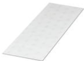
Shock protection, Sheet, transparent, unlabeled, mounting type: adhesive, lettering field size: 80 x 42 mm

Please be informed that the data shown in this PDF Document is generated from our Online Catalog. Please find the complete data in the user's documentation. Our General Terms of Use for Downloads are valid ( http://phoenixcontact.com/download )