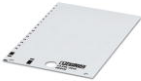
The figure shows the white version

Label, Card, yellow, unlabeled, can be labeled with: THERMOMARK PRIME, THERMOMARK CARD, BLUEMARK ID, BLUEMARK ID COLOR, mounting type: adhesive, lettering field size: 20 mm x 8 mm