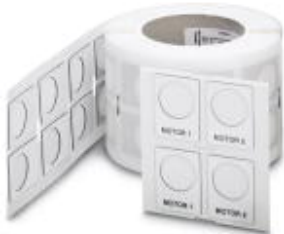
The figure shows the white version

Plastic label with drill hole, Roll, white, Unlabeled, Can be labeled with: THERMOMARK ROLL, THERMOMARK X, THERMOMARK S1.1, Mounting type: Adhesive, Lettering field: 45 x 10 mm