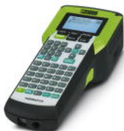
Portable thermal transfer printer for roll material

Please be informed that the data shown in this PDF Document is generated from our Online Catalog. Please find the complete data in the user's documentation. Our General Terms of Use for Downloads are valid ( http://phoenixcontact.com/download )