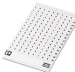
Marker card, self-adhesive, horizontally labeled with the consecutive numbers: 1 ... 10, 10-section marker strips with 14 identical decades, white

Please be informed that the data shown in this PDF Document is generated from our Online Catalog. Please find the complete data in the user's documentation. Our General Terms of Use for Downloads are valid ( http://phoenixcontact.com/download )