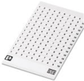
Marker card, self-adhesive, horizontally labeled with the consecutive numbers: 11 ... 20, 10-section marker strips with 14 identical decades, white

Please be informed that the data shown in this PDF Document is generated from our Online Catalog. Please find the complete data in the user's documentation. Our General Terms of Use for Downloads are valid ( http://phoenixcontact.com/download )