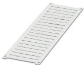
Marker sheet, for Siemens SIRIUS 3R switchgear series, 80-section, 20 strips à 4 markers, labeling with M-PEN, CMS system or BMKT labels, lettering field: 10 x 7 mm

Please be informed that the data shown in this PDF Document is generated from our Online Catalog. Please find the complete data in the user's documentation. Our General Terms of Use for Downloads are valid ( http://phoenixcontact.com/download )