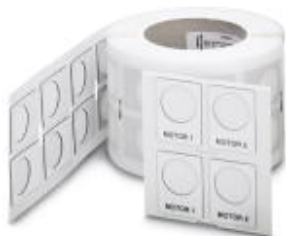
The figure shows the white version

Plastic label with drill hole, Roll, silver, Unlabeled, Can be labeled with: THERMOMARK ROLL, THERMOMARK X, THERMOMARK S1.1, Mounting type: Adhesive, Lettering field: 30 x 12 mm