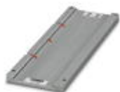
Magazine, for CMS-P1-PLOTTER, for accommodating UC-EMP..., UC-EMLP...