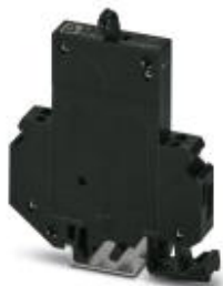
Thermomagnetic circuit breaker, 1-pos., fast blow, 1 N/C contact, with universal foot for mounting on NS 32 or NS 35

Please be informed that the data shown in this PDF Document is generated from our Online Catalog. Please find the complete data in the user's documentation. Our General Terms of Use for Downloads are valid ( http://phoenixcontact.com/download )