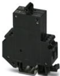
Thermomagnetic circuit breaker, 2-pos., fast blow, 1 N/O contact and 1 N/C contact, with universal foot for mounting on NS 32 or NS 35

Please be informed that the data shown in this PDF Document is generated from our Online Catalog. Please find the complete data in the user's documentation. Our General Terms of Use for Downloads are valid ( http://phoenixcontact.com/download )