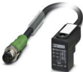
Sensor/actuator cable, 3-position, PUR, black-gray RAL 7021, Plug straight M12, A-coded, on Valve connector CI (9.4 mm), with 1 LED, connected with Z diode, connected with Z diode, cable length: 5 m

Please be informed that the data shown in this PDF Document is generated from our Online Catalog. Please find the complete data in the user's documentation. Our General Terms of Use for Downloads are valid ( http://phoenixcontact.com/download )