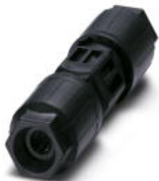
QUICKON cable connector, black, 4+PE-pos., 1.0 mm 2 ... 2.5 mm 2 / 690 V / 20 A, for 9 mm ... 16 mm cable diameter.

Please be informed that the data shown in this PDF Document is generated from our Online Catalog. Please find the complete data in the user's documentation. Our General Terms of Use for Downloads are valid ( http://phoenixcontact.com/download )