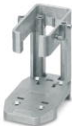
HEAVYCON DIN rail mounting frame, lower part for double locking latch, for sleeve housing with double locking latch or HC-CIF-..HFFD..., for type B10 contact inserts, for NS35/7,5 DIN rails

Please be informed that the data shown in this PDF Document is generated from our Online Catalog. Please find the complete data in the user's documentation. Our General Terms of Use for Downloads are valid ( http://phoenixcontact.com/download )