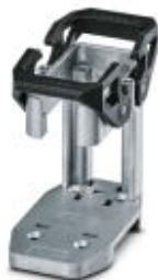
HEAVYCON DIN rail mounting frame, lower part with double locking latch, for housing without double locking latch or HC-CIF-..HFFD.. upper part, for type B10 contact inserts, for NS35/7,5 DIN rails

Please be informed that the data shown in this PDF Document is generated from our Online Catalog. Please find the complete data in the user's documentation. Our General Terms of Use for Downloads are valid ( http://phoenixcontact.com/download )