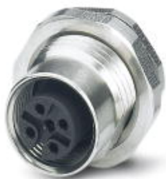
Flush-type connector, 4-position, Socket, straight, M12, A-coded, Rear mounting, Pg9, Solder pins

Please be informed that the data shown in this PDF Document is generated from our Online Catalog. Please find the complete data in the user's documentation. Our General Terms of Use for Downloads are valid ( http://phoenixcontact.com/download )