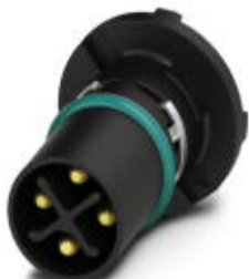
Flush-type connector, Universal, 4-position, Plug, straight, S power, PCB mounting, THR solder connection

Please be informed that the data shown in this PDF Document is generated from our Online Catalog. Please find the complete data in the user's documentation. Our General Terms of Use for Downloads are valid ( http://phoenixcontact.com/download )