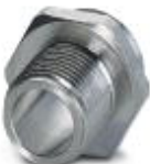
M12 pin, front mounting THR with M14 screw fastening

Housing screw connection - SACC-DSIV-M12-PLUG-9 THR - 1417984