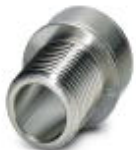
M12 pin, housing screw connection, press-in version, for all Speedcon-compatible THR and wave soldering contact carriers

Housing screw connection - SACC-M12 PLUG PRESS - 1437892