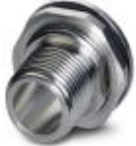
Housing screw connection, Plug, M12, Rear mounting, M15 x 1

Housing screw connection - SACC-BP-M-M12/M15-7-THR - 1413996