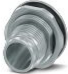
Housing screw connection, Plug, M12-Push-Pull, Rear mounting, THR- und Wellenlötkontakte

Housing screw connection - SACC-BP-M-M12-THR PP - 1027661