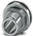
M12 SPEEDCON housing screw connection for M12 male inserts, with O-ring, for all SPEEDCON-capable THR and wave soldering contact carriers

Housing screw connection - SACC-BP-M-M12/M15-6-THR SCO - 1413999