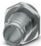
Housing screw connection, Plug, M12-Push-Pull, Front mounting, THR- und Wellenlötkontakte

Housing screw connection - SACC-FP-M-M12-THR PP - 1027679