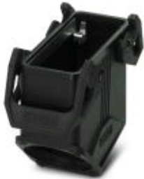
HEAVYCON EVO coupling housing, plastic, with bayonet flange for EVO screw connection, B16, with double locking latch, height: 84 mm, without EVO screw connection

Please be informed that the data shown in this PDF Document is generated from our Online Catalog. Please find the complete data in the user's documentation. Our General Terms of Use for Downloads are valid ( http://phoenixcontact.com/download )