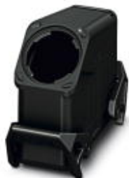
HEAVYCON EVO coupling housing, plastic, with bayonet flange for EVO screw connection, B24, with double locking latch, height: 90 mm, without EVO screw connection

Please be informed that the data shown in this PDF Document is generated from our Online Catalog. Please find the complete data in the user's documentation. Our General Terms of Use for Downloads are valid ( http://phoenixcontact.com/download )