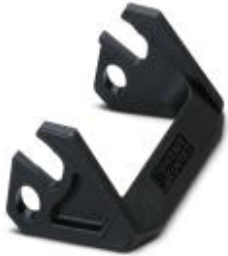
Replacement single locking latch for HEAVYCON EVO housing type B10, PA

Please be informed that the data shown in this PDF Document is generated from our Online Catalog. Please find the complete data in the user's documentation. Our General Terms of Use for Downloads are valid ( http://phoenixcontact.com/download )