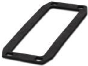
Replacement flat gasket, for HEAVYCON EVO panel mounting base type B24

Please be informed that the data shown in this PDF Document is generated from our Online Catalog. Please find the complete data in the user's documentation. Our General Terms of Use for Downloads are valid ( http://phoenixcontact.com/download )