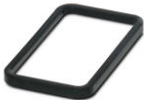
Profile gasket for HEAVYCON EVO supporting base element type B10

Please be informed that the data shown in this PDF Document is generated from our Online Catalog. Please find the complete data in the user's documentation. Our General Terms of Use for Downloads are valid ( http://phoenixcontact.com/download )