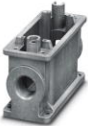
HEAVYCON ADVANCE B16 box mounting base, for M6 screw locking, salt-water-resistant aluminum, with 2 x M32 thread, without surface coating

Please be informed that the data shown in this PDF Document is generated from our Online Catalog. Please find the complete data in the user's documentation. Our General Terms of Use for Downloads are valid ( http://phoenixcontact.com/download )