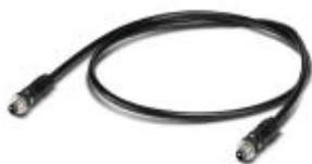
GOF MM cable, assembled with M12 OPTIC to M12 OPTIC

Assembled FO cable, round cable, 50/125 µm GOF-MM fiber, M12 to M12, for installation inside buildings