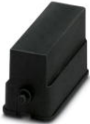
Protective cover for sleeve housing, IP54

Please be informed that the data shown in this PDF Document is generated from our Online Catalog. Please find the complete data in the user's documentation. Our General Terms of Use for Downloads are valid ( http://phoenixcontact.com/download )