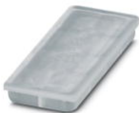
Coated protective cover for the housing on the motor side

Please be informed that the data shown in this PDF Document is generated from our Online Catalog. Please find the complete data in the user's documentation. Our General Terms of Use for Downloads are valid ( http://phoenixcontact.com/download )