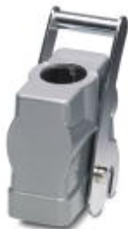
HEAVYCON sleeve housing B16, with main latch, height 76 mm, with 1x M32 thread, straight conductor outlet

Please be informed that the data shown in this PDF Document is generated from our Online Catalog. Please find the complete data in the user's documentation. Our General Terms of Use for Downloads are valid ( http://phoenixcontact.com/download )