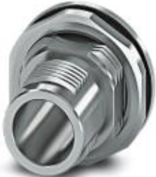
M12 SPEEDCON housing screw connection for M12 male inserts, with O-ring, for all SPEEDCON-capable THR and wave soldering contact carriers

Please be informed that the data shown in this PDF Document is generated from our Online Catalog. Please find the complete data in the user's documentation. Our General Terms of Use for Downloads are valid ( http://phoenixcontact.com/download )