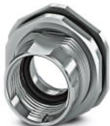
Housing screw connection, Socket, M12-SPEEDCON, Rear mounting, M15 x 1

Please be informed that the data shown in this PDF Document is generated from our Online Catalog. Please find the complete data in the user's documentation. Our General Terms of Use for Downloads are valid ( http://phoenixcontact.com/download )