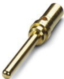
D-SUB crimp contact, connection method: Crimp connection, connection cross section: AWG 28- 26

Please be informed that the data shown in this PDF Document is generated from our Online Catalog. Please find the complete data in the user's documentation. Our General Terms of Use for Downloads are valid ( http://phoenixcontact.com/download )