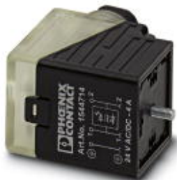
Valve connectors, pnp, 3-position, Valve connector A, connected with Z diode, Screw connection, cable gland M16, external cable diameter 5 mm ... 10 mm

Please be informed that the data shown in this PDF Document is generated from our Online Catalog. Please find the complete data in the user's documentation. Our General Terms of Use for Downloads are valid ( http://phoenixcontact.com/download )