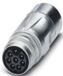
Coupler connector, straight, for standard and SPEEDCON interlock, M17, number of positions: 7+PE, type of contact: Pin, Crimp connection, shielded: yes, cable diameter range: 5 mm ... 9.2 mm

Please be informed that the data shown in this PDF Document is generated from our Online Catalog. Please find the complete data in the user's documentation. Our General Terms of Use for Downloads are valid ( http://phoenixcontact.com/download )