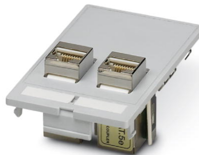
Illustration shows the product version VS-SI-FP-2RJ45-5-MOD-BU/BU

http://eshop.phoenixcontact.de/phoenix/treeViewClick.do?UID=1657724