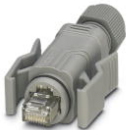
The figure shows the gray product version

Please be informed that the data shown in this PDF Document is generated from our Online Catalog. Please find the complete data in the user's documentation. Our General Terms of Use for Downloads are valid ( http://phoenixcontact.com/download )