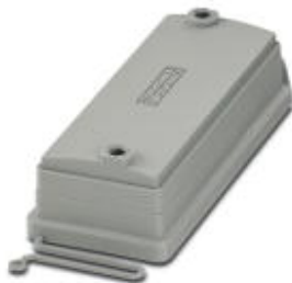
Protective cover B16, Clip locking, protective cover material: PA, height: 31.2 mm, seal: no, With lanyard, diameter of retaining cord eyelet: 4 mm

Please be informed that the data shown in this PDF Document is generated from our Online Catalog. Please find the complete data in the user's documentation. Our General Terms of Use for Downloads are valid ( http://phoenixcontact.com/download )