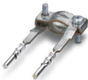
Shield connection for one shielded cable on female contact carriers, without loose crimp contacts

Please be informed that the data shown in this PDF Document is generated from our Online Catalog. Please find the complete data in the user's documentation. Our General Terms of Use for Downloads are valid ( http://phoenixcontact.com/download )