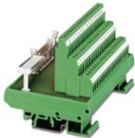
VARIOFACE module, for mounting on NS 35/7.5 or NS 32, for connecting 16 proximity switches

Please be informed that the data shown in this PDF Document is generated from our Online Catalog. Please find the complete data in the user's documentation. Our General Terms of Use for Downloads are valid ( http://phoenixcontact.com/download )