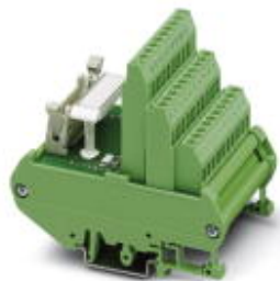
VARIOFACE sensor module, for connecting 8 pnp sensors

Please be informed that the data shown in this PDF Document is generated from our Online Catalog. Please find the complete data in the user's documentation. Our General Terms of Use for Downloads are valid ( http://phoenixcontact.com/download )