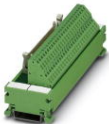
VARIOFACE module, with spring-cage connection and flat-ribbon cable connector, for mounting on NS 35/7.5, 26-pos.

Please be informed that the data shown in this PDF Document is generated from our Online Catalog. Please find the complete data in the user's documentation. Our General Terms of Use for Downloads are valid ( http://phoenixcontact.com/download )