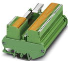
VARIOFACE module for ABB S800 I/O, with knife disconnect terminal blocks and specific marking (A1, B1, C1, A2, B2, C2, ... A8, B8, C8)

Please be informed that the data shown in this PDF Document is generated from our Online Catalog. Please find the complete data in the user's documentation. Our General Terms of Use for Downloads are valid ( http://phoenixcontact.com/download )