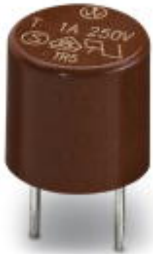
Replacement fuse, for INTERBUS-ST modules

Please be informed that the data shown in this PDF Document is generated from our Online Catalog. Please find the complete data in the user's documentation. Our General Terms of Use for Downloads are valid ( http://phoenixcontact.com/download )