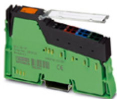
Inline coupling module, complete with accessories (connector and marking label)

Please be informed that the data shown in this PDF Document is generated from our Online Catalog. Please find the complete data in the user's documentation. Our General Terms of Use for Downloads are valid ( http://phoenixcontact.com/download )