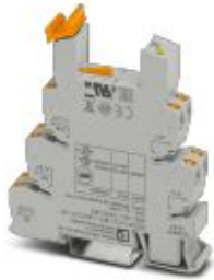
14 mm PLC basic terminal block with push-in connection, without relay or solid-state relay, for mounting on DIN rail NS 35/7,5, 2 PDTs, input voltage 24 V DC

Please be informed that the data shown in this PDF Document is generated from our Online Catalog. Please find the complete data in the user's documentation. Our General Terms of Use for Downloads are valid ( http://phoenixcontact.com/download )