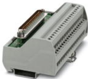
VARIOFACE module, with screw connection and male D-SUB miniature pin strip, for mounting on NS 35 rails, 37-pos.

Please be informed that the data shown in this PDF Document is generated from our Online Catalog. Please find the complete data in the user's documentation. Our General Terms of Use for Downloads are valid ( http://phoenixcontact.com/download )