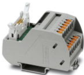
VARIOFACE interface module, with push-in connection and light indicator, for 8 channels

Please be informed that the data shown in this PDF Document is generated from our Online Catalog. Please find the complete data in the user's documentation. Our General Terms of Use for Downloads are valid ( http://phoenixcontact.com/download )