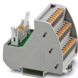
VARIOFACE sensor module, with push-in connection, for connecting 8 pnp sensors

Please be informed that the data shown in this PDF Document is generated from our Online Catalog. Please find the complete data in the user's documentation. Our General Terms of Use for Downloads are valid ( http://phoenixcontact.com/download )